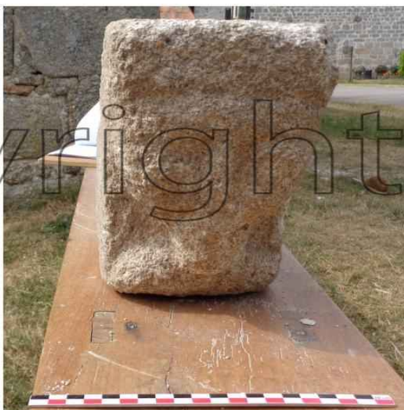
LAP21. Modillon 359